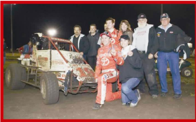
The TK Motorsports team in Silver Dollar Speedway "Victory Lane" after driving from 8th to win the 30 lap "John Padjen Classic."

For More Photos, please visit: http://clevelanddigitalimaging.webs.com http://www.mmracingphotos.com